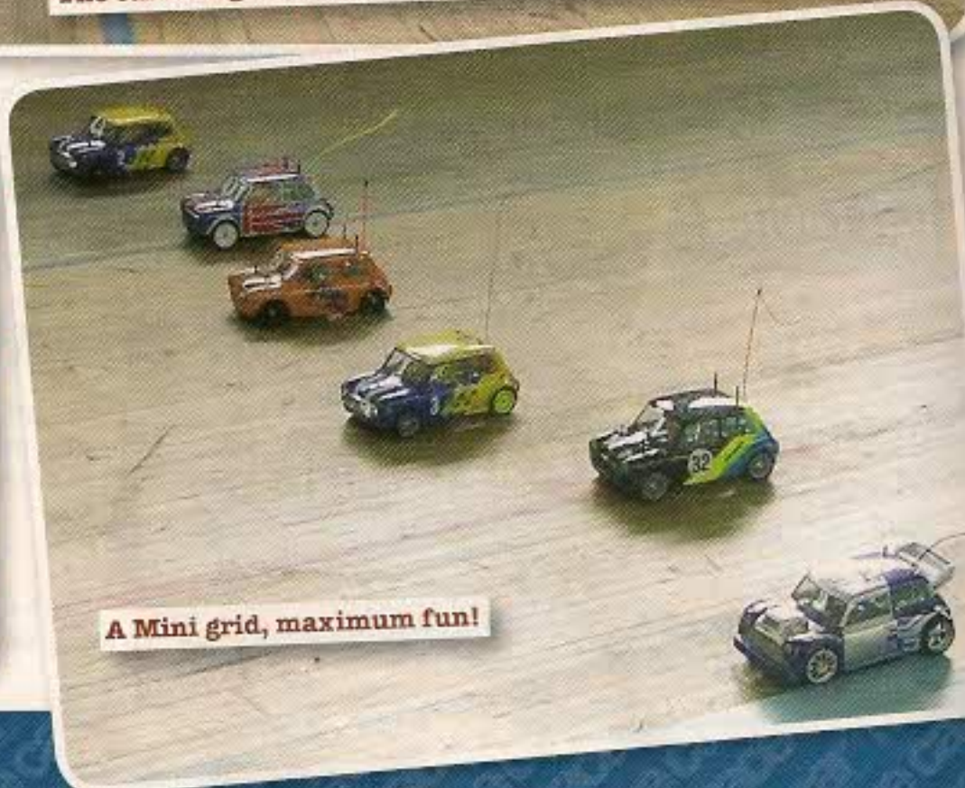
A Mini grid, maximum fun!