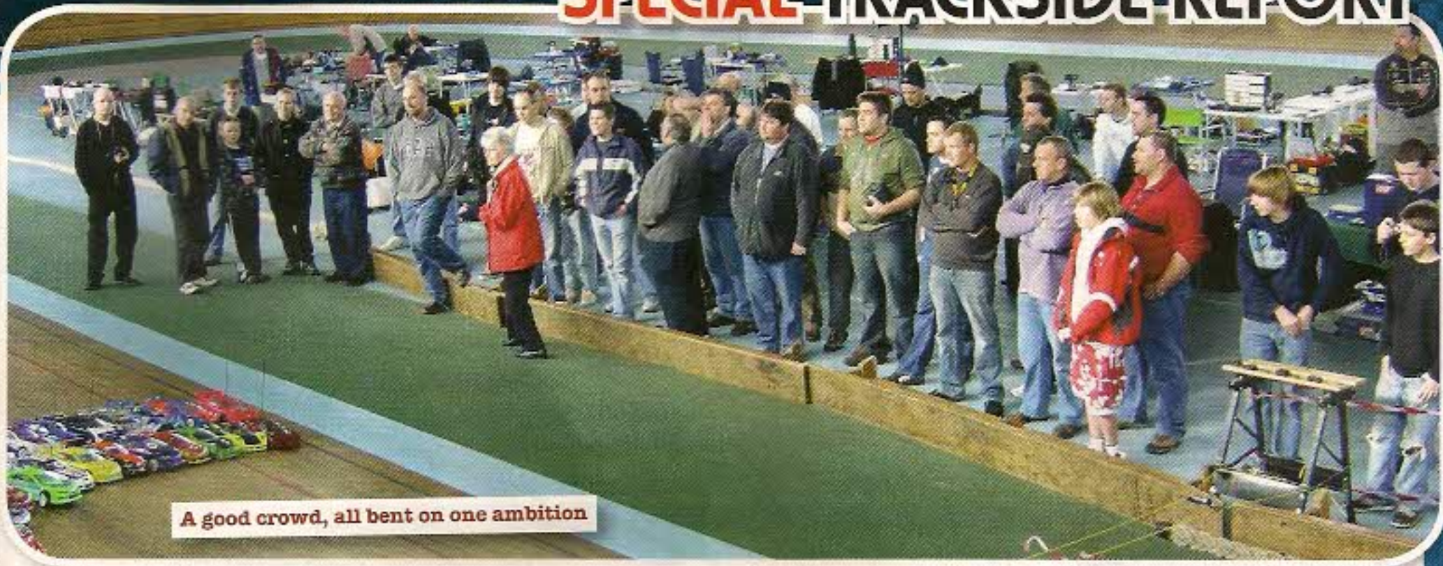
A good crowd, all bent on one ambition

fast a possible. Last year's lap record at the Thunderdrome was a 5.3 second lap equating to a whopping 62 mph!