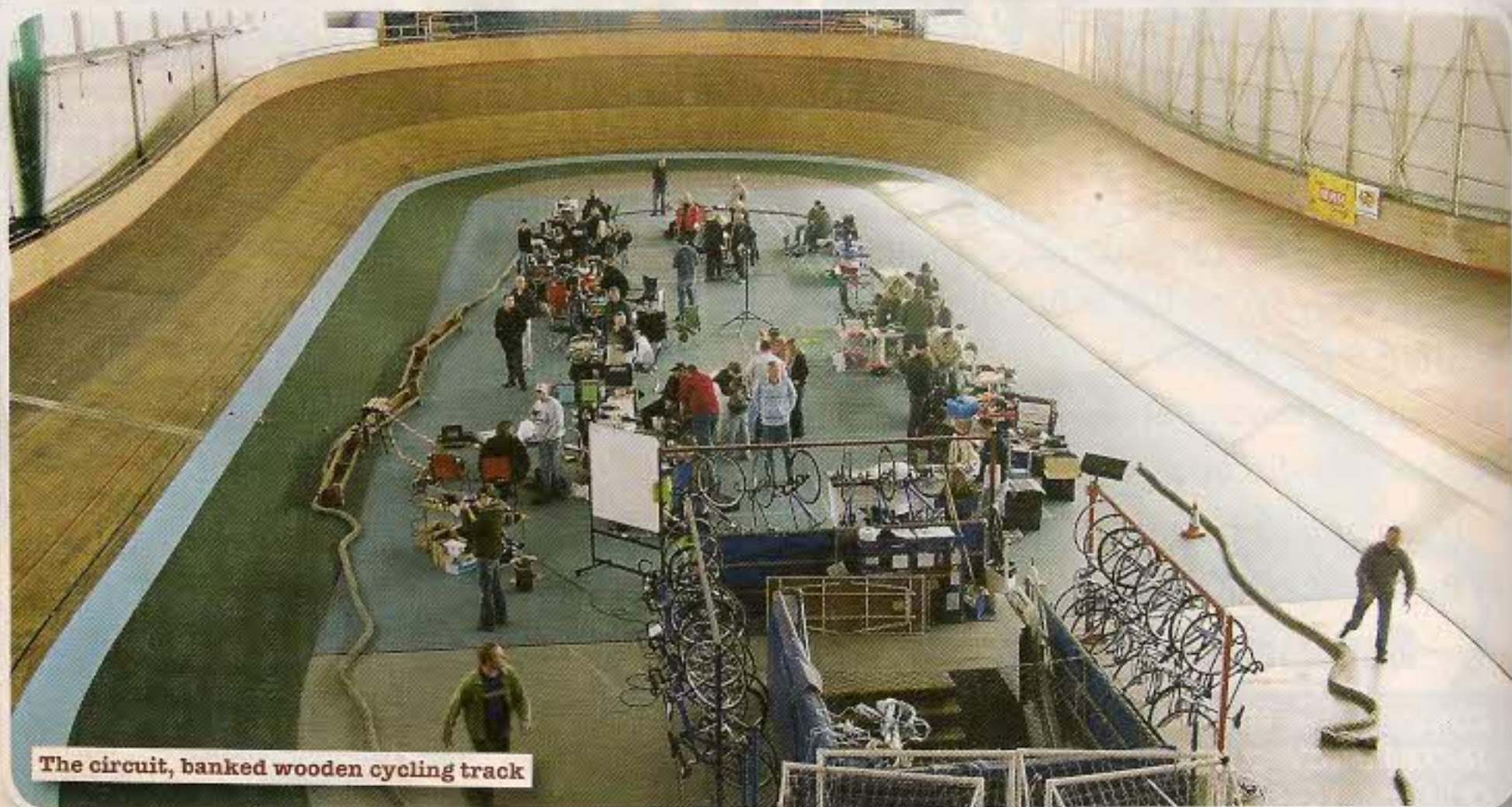
The circuit, banked wooden cycling track

The day started bright and early and 45 drivers prepared for a day's racing featuring the high 30 degree banked wooden curves of the famous cycling track at Calshot's velodrome. This was the 7th year that South Hants Model Car Club (SHMCC.org) had run this annual race and lots of familiar faces and some new ones got a few practice laps before racing started.